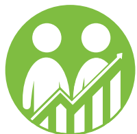
Employment and economic participation