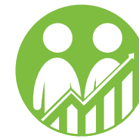
Employment and economic participation