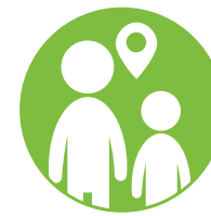
Demographics and migration