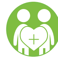
Health and high-risk behaviors

The action plan also identifies the main stakeholders responsible for implementing each of these interventions; which include 17 Ministries, public institutions, civil society organizations, educational institutes, health centers, municipalities and international NGOs. The plan also includes a framework for monitoring and evaluating recommendations and interventions.