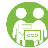
Social integration and political participation