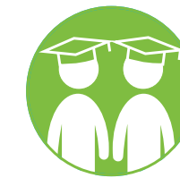
Education and culture participation