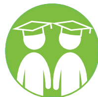
Education and culture participation