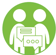
Social integration and political participation