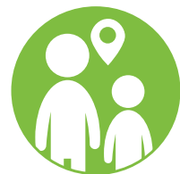
Demographics and migration